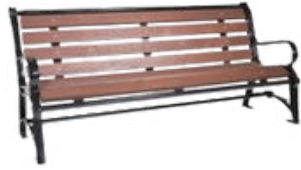
F-102 | $2,175 6' recycled plastic bench