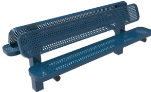
F-129 | $1,674 double pedestal bench