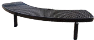
F-122 | $1,200 curved bench