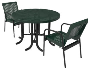
F-131 | $1,850 bistro set table and 2 stacking chairs