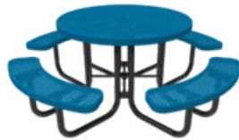
F-130 | $1,395 round portable table