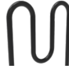
F-118 | $391 2 loop bike rack (5 bike capacity) other loop quantities avail.