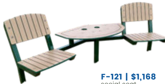
F-121 | $1,168 social seat