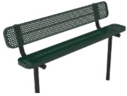
F-100 | $728 6' essentials bench