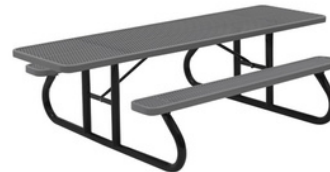
F-106 | $1,338 8' ada portable table