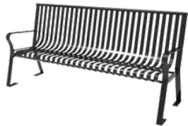
F-128 | $1,815 6' downtown bench