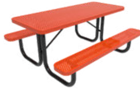
F-132 | $1,275 6' portable table