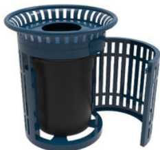
F-135 | $1,715 skyline flare top