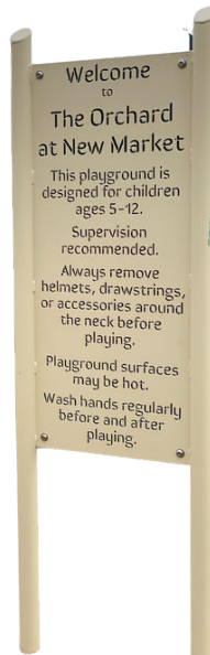
F-124 | $845 playground sign w/ custom park name