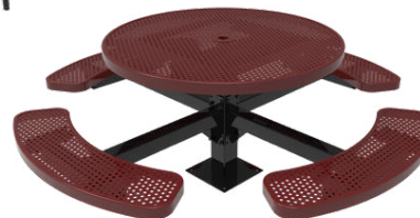
F-133 | $2,016 round pedestal table solid top opt avail.