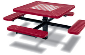
F-107 | $2,515 game table