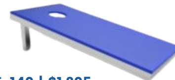
F-140 | $1,205 cornhole boards- set of 2 *does not include cornhole bags