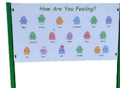
F-123 | $4,315 communication board double sided