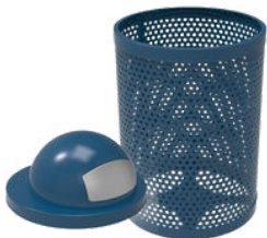
F-112 | $929 essentials with dome lid