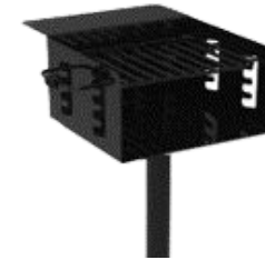
F-120 | $540 park grill