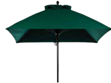
F-141 | $655 market umbrella with u-brace